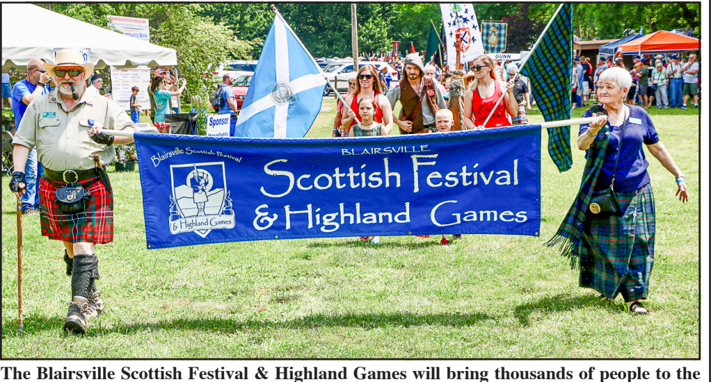
North Georgia Mountains this weekend.